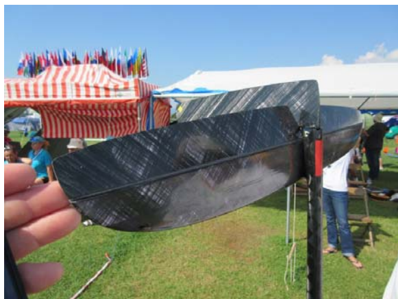
New wing tips from NAN for the Explorer. No more up swept tip to snap off during storage.