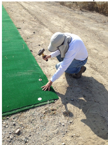
Each nail is hand started