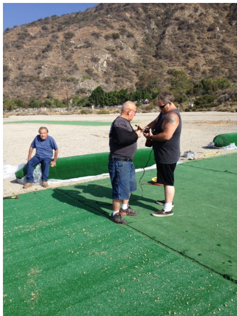
One armed manager on site