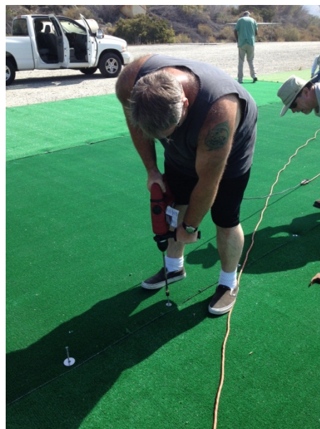
Then it is pounded in by a hammer drill. Talk about fun! WOW